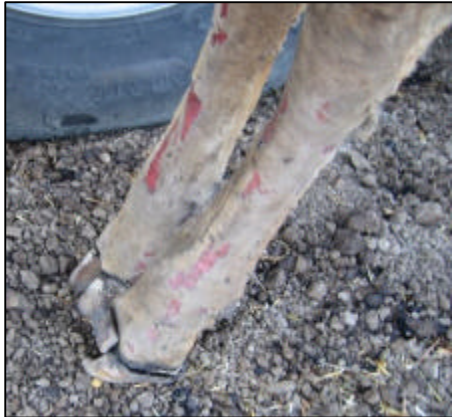
Figure 5. Burned legs of sheep with compromised hoof walls.

burned animal is challenging because the depth/severity of the burn may be difficult to ascertain and the animal may not appear distressed or painful. The burned area may have destroyed the nerve endings and no pain behavior is observed despite severe tissue damage. Vital signs such as heart rate also may be deceptively low. For example, burned sheep from a fire in Zamora, CA in 2006 were walking normally, but their burned legs were without hoof walls which exposed the bone. The animals with burns that are more painful to touch may not be as severely compromised in the long-term. Daily reassessment of all burned animals is necessary.