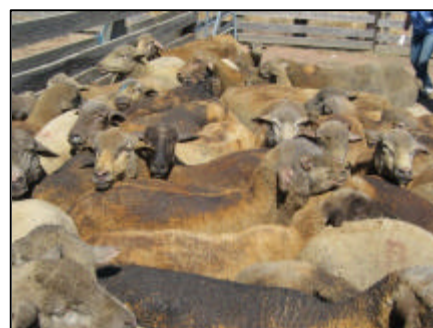
Figure 4. Sheep with varying degrees of burns and smoke inhalation from wildfire.

Give livestock ample time to recover from smoke-induced airway insult. Airway damage resulting from wildfire smoke takes 4 to 6 weeks to heal. Therefore, plan on giving livestock 4 to 6 weeks to recuperate after the air quality returns to normal. Attempting to handle, move, or transport livestock may aggravate the condition, delay the healing process, and compromise the performance of livestock for many weeks or months.