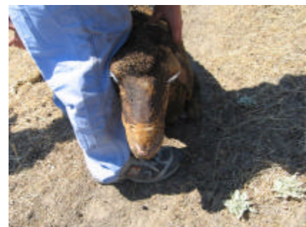
Figure 2. Initial burns cause swelling of the face and eyes.

How Does Smoke Affect Livestock? The effects of smoke are similar for humans and livestock: irritation of the eyes and respiratory tract, aggravation of chronic lung diseases, and reduced lung function. High concentrations of particulates can cause persistent cough, increased nasal discharge, wheezing and increased physical effort in breathing. Particulates can also alter the immune system and reduce the ability of the lungs to remove foreign materials, such as pollen and bacteria, to which livestock are normally exposed.