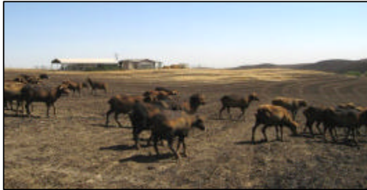
Figure 1. Sheep with mild burns and sore feet from wildfire.