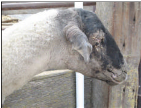
Figure 9. Leather-like skin 10-days post burn.

Reassess, reassess, reassess on a daily basis. The severity of the burn and the compromise in the health of the animals will become apparent. It is difficult to judge burned animals initially, but the burned areas of skin become leather-like and slough in 5-14 days, while systemic signs may worsen. Animals which go "off" feed require careful examination for complications. Ability and desire to eat and drink are good indicators but can change up to 6 weeks following injuries caused by the burns and smoke inhalation of wildfires.