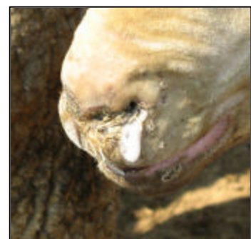
Figure 6. Exudate in nostrils should be removed to assist with breathing.

Approved medications for pain relief in livestock species may be obtained through a licensed veterinarian.