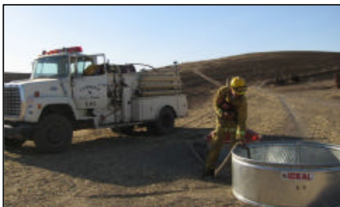
Figure 3. Water supplied to livestock by local fire crews.

Limit exercise when smoke is visible. Don't force livestock to perform activities or increase exercise that increase the airflow in and out of the lungs. This can trigger bronchoconstriction (narrowing of the small airways in the lungs).