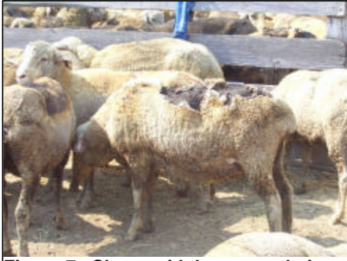
Figure 7. Sheep with burns on their back; also check the condition of their feet.

For deep burns with or without contamination, antibiotic treatment may be beneficial. Consult a livestock veterinarian for appropriate medications.