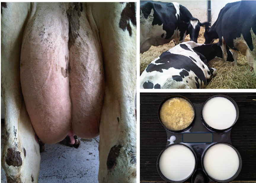
FIGURE 1 Severe clinical mastitis characterized by abnormalities in milk (bottom right panel), mammary gland (left panel) and behaviour (top right panel) due to Streptococcus uberis infection.

to more than 100 days in milk (Bradley & Green, 2000). In herds with bulk milk somatic cell count (BMSCC) below 250,000 cells/ml, more than 50% of early lactation coliform CM were due to dry-period infection (Bradley & Green, 2000). The difference between onset of infection and clinical manifestation of disease has been attributed to polarization of the immune response and anti-inflammatory signalling during the dry period (Quesnell et al., 2012; Schukken et al., 2011b). Onset of infection in the dry period leading to CM in lactation has also been observed for Klebsiella , Citrobacter and Serratia spp. (Bradley & Green, 2000). For prevention of environmental mastitis, it is important to determine whether CM in early lactation is due to infections during the dry period or during lactation. Control measures need to target the relevant infection risks, for example, poor environmental hygiene or non-use of teat-sealants in the dry period, versus inadequate hygiene or nutrition in lactation.