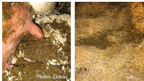
FIGURE 4 Faecal contamination is a major source of exposure to environmental pathogens regardless of the use of sawdust (left), straw (right) or other bedding material.

Faecal shedding has been documented for S. agalactiae (Jørgensen et al., 2016), S. uberis (Zadoks, Tikofsky, & Boor, 2005) and Klebsiella (Munoz et al., 2006), and average faecal prevalence ranges from 5% to 23% and >80%, respectively, with considerable