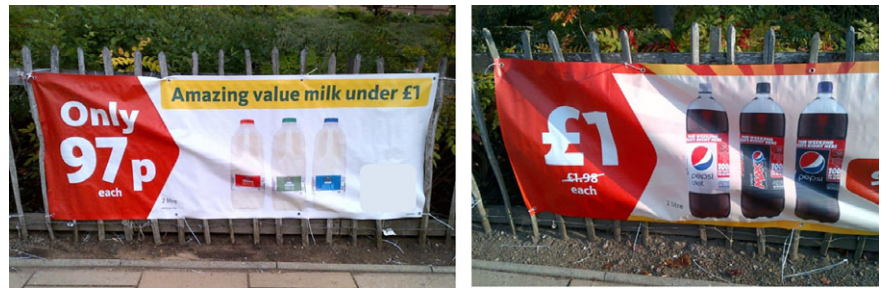
FIGURE 5 “Amazing value milk,” produced by sentient beings but sold at a lower price than soft drinks, illustrating financial pressures on the dairy industry. If the soft drinks had not been on sale, they would have cost more than twice as much as milk.

species (Hertl et al., 2014a, 2014b). Yield losses may persist for months after coliform or GPCN mastitis, whilst CM with non-aureus staphylococci does not cause reduced production (Hertl et al., 2014a). The association of pathogens with culling risk differs between heifers and multiparous animals, lactation stages and number of CM episodes, with different combinations of factors identifying different pathogen species as being associated with the highest risk of culling (Cha et al., 2013; Gröhn et al., 2005). Other costs of mastitis are even harder to quantify and relate to its impact on public perception, notably perceptions around animal welfare and use of antimicrobials. This creates a dilemma as treatment of mastitis may be necessary for welfare reasons, and would often involve the use of antimicrobials.